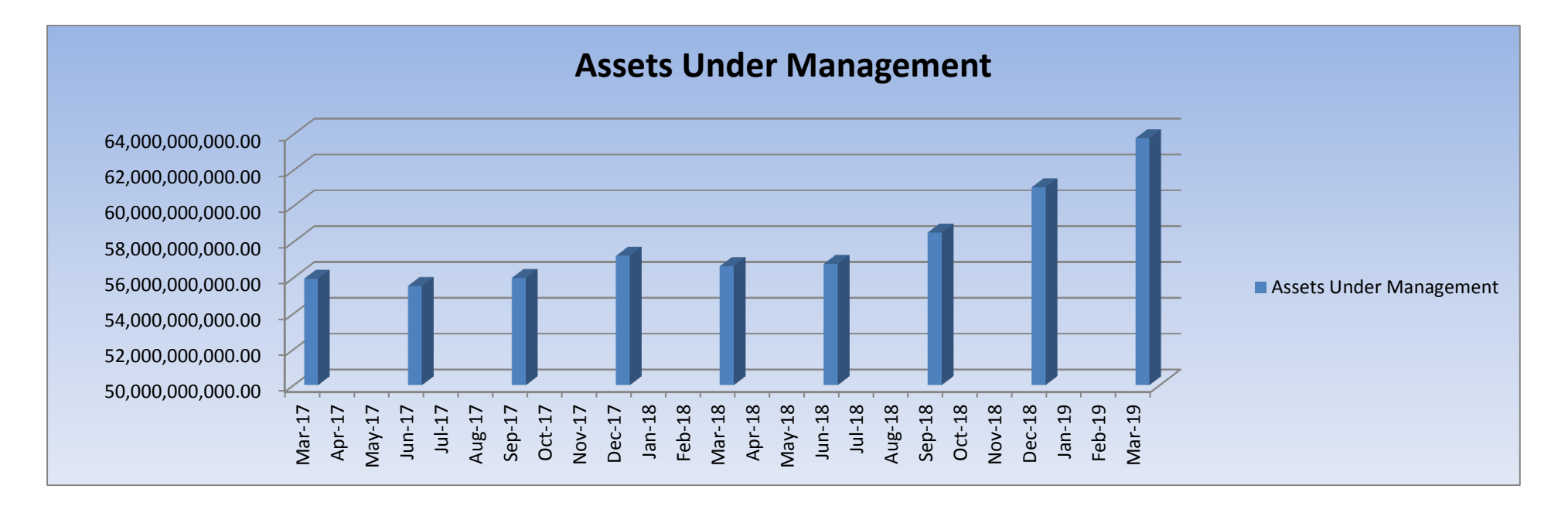
Figure 2: Assets under management

The assets under management increased steadily over the past two years from Ksh 55 billion as at 31<sup>st</sup> March 2017 to Ksh 64 billion as at 31<sup>st</sup> March 2019